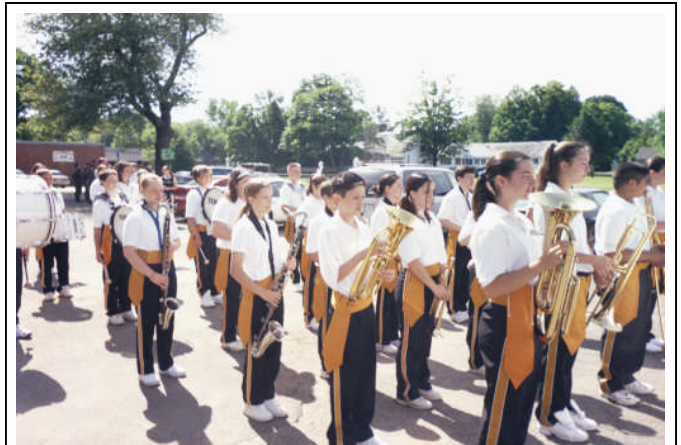
The Middle School Marching Band performs at the East Windsor Memorial Day Parade

“The nation’s top business executives agree that arts education programs can help repair weaknesses in American education and better prepare workers for the 21 st century.” “The Changing Workplace is Changing Our View of Education.” Business Week, October 1996.